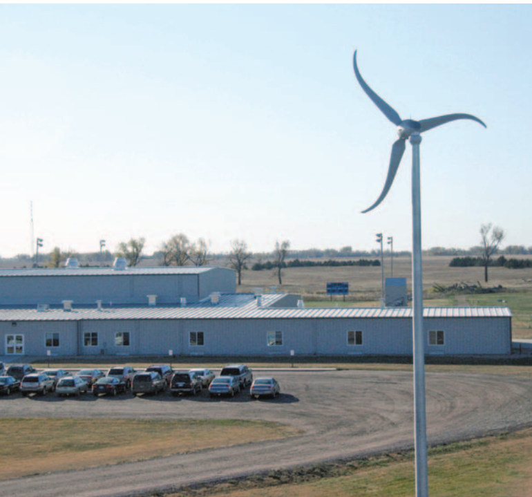
Sanborn Central School in Forestburg, South Dakota, installed a Skystream 3.7 wind turbine as part of Wind Powering America's Wind for Schools project.

The Wind for Schools Project approach is to implement a wind energy training center at state-based universities or colleges. As part of the wind energy curriculum activities, college students assist with installing small wind turbines at primary and secondary schools.