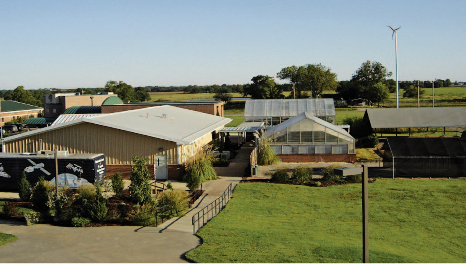
The Greenbush Science Center in Greenbush, Kansas, installed a Skystream 3.7 wind turbine as part of Wind Powering America's Wind for Schools project.

State energy office: The state energy or development office provides technical, financial, and managerial support for the project as appropriate, generally through the WAC and state facilitator. The state energy office will also identify grants and other funding opportunities for Wind for Schools projects.